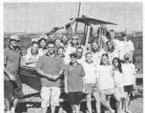
Proud new owners of the Benowa High training vessel - the Cyril Connell