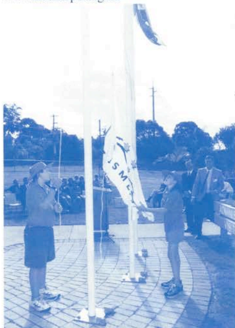
AUSMEPA Flag raising ceremony