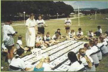
Year 7 Emmanuel College

Years 1-3 programs introduce students to conservation good habits through felt board characters and big book stories.