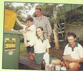
1998 Banksia Environmental Foundation Award – Education and Training