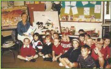
Year 1 Miami