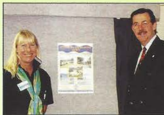
Caravan industry manual