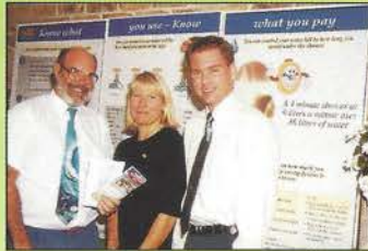
Shopping centre displays