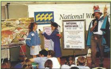
Australia Fair Centre Stage

Students play the Nerang River Game to learn more about the Gold Coast catchment and how they can look after it.