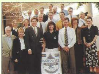
The Banksia award winning team