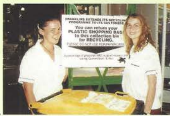
Shopping Centre Recycling