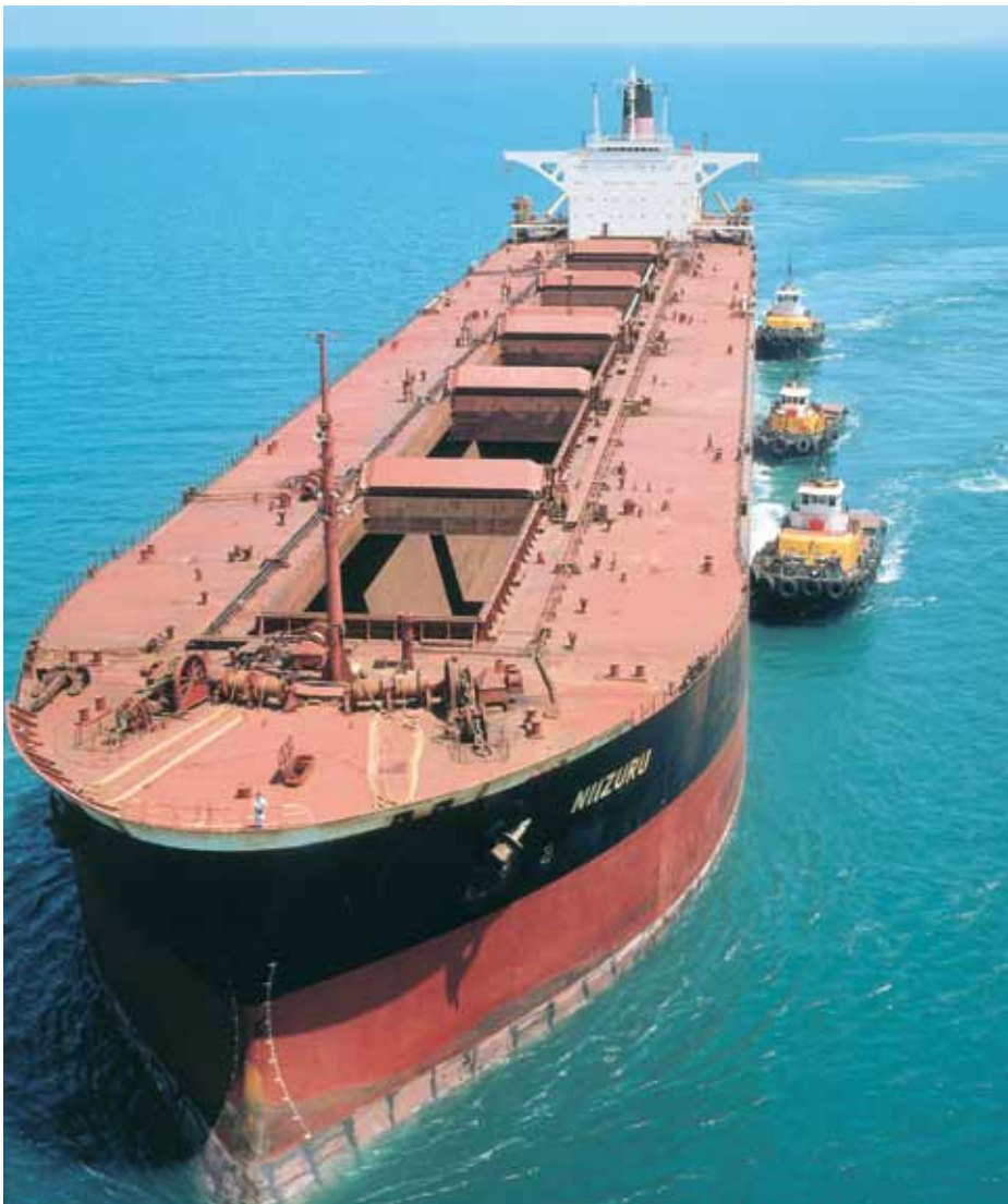
This is a bulk carrier.