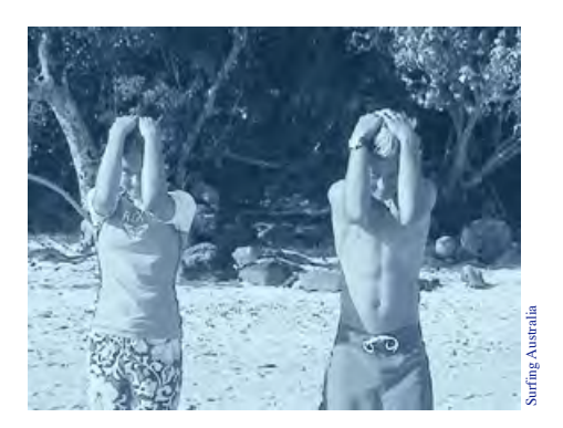
Figure 14.2 The cover up technique.

Board control is an important skill when surfing. Don't shoot your board out when you dismount. Always try and dismount under control.