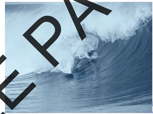
Figure 14.3 Surfer pulling out through back of wave