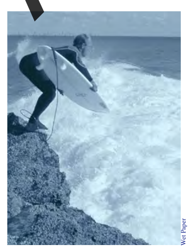
Figure 13.3 Jumping off the rocks requires great skill and timing