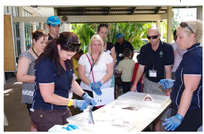
Fish heads dissection Airlie Beach