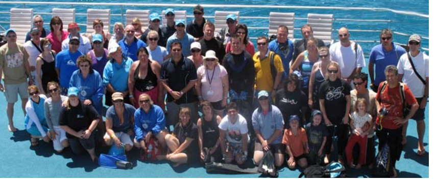
State Conference Delegates 2009 Knuckle Reef Field Trip