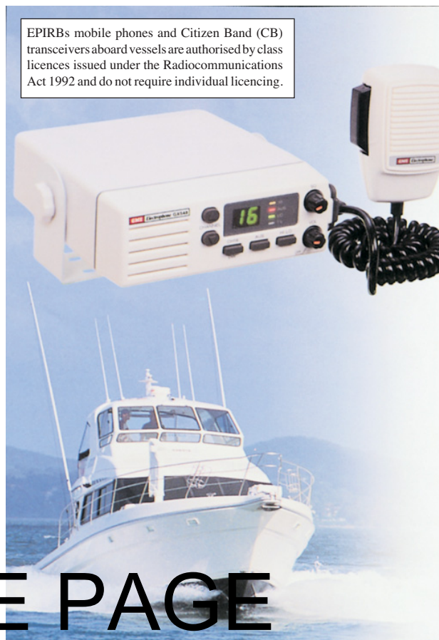
Figure 3.1 In this course you will learn to use a marine radio to send and receive messages at sea