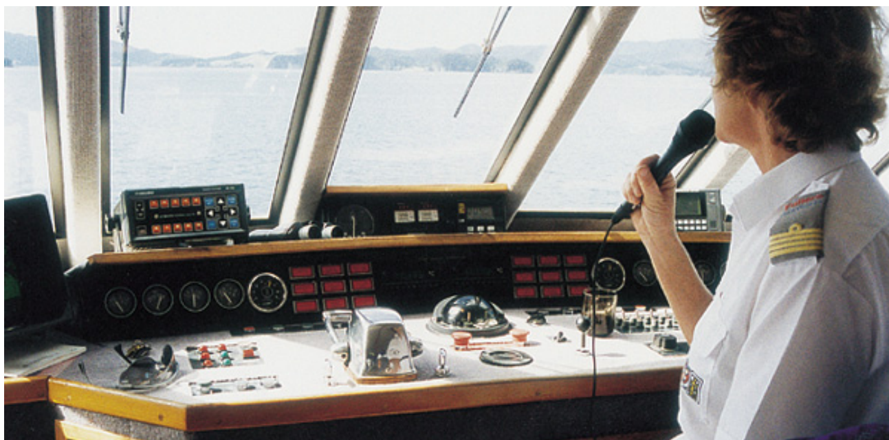
Figure 27.1 Effective voice procedures are transferrable to other skills in the maritime industry

Higher pitched voices are often transmitted more successfully than those of a lower pitch. This is why radio operators used in taxi control centres, telephone service operators, etc are often females.